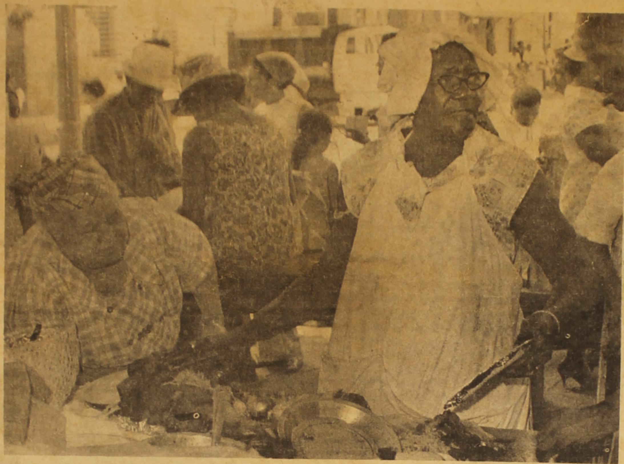
LIKE THE GOLDEN OLD DAYS - Two elderly ladies are shown as they sell native foods during the Carnival Food Fair at the Market Square Tuesday. Displayed and sold at the annual affair are native foods, candies, vegetables, shell work and other native items, which are getting increasing harder to obtain.

Recently, however, the problem of sewage disposal and pollution of the harbor has become a serious problem in Cruz Bay, and property owners have expressed considerable concern at the present faulty system.